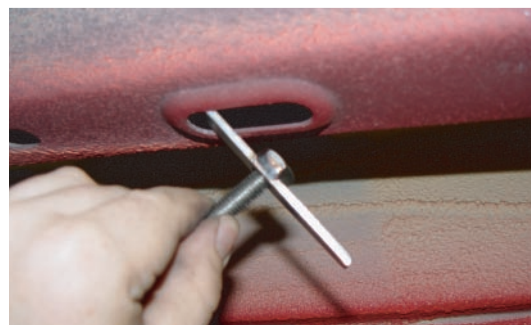
Pilt 2 / Pic. 2