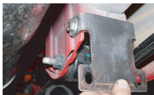
Pilt 4 / Pic. 4