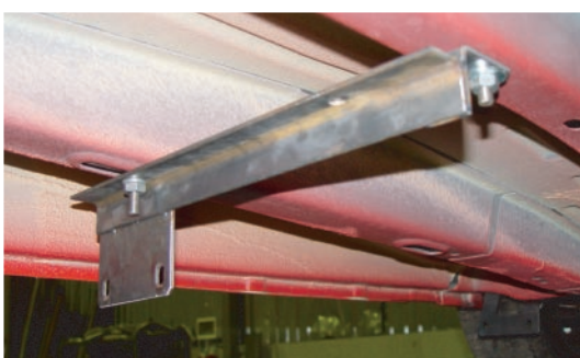
Pilt 3 / Pic. 3