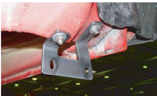
Pilt 1 / Pic. 1